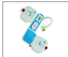
CPR-D•padz offer clear anatomical placement illustrations and a CPR hand-positioning landmark.

The unique one-piece design of ZOLL's CPR-D•padz addresses these problems by orienting the simple design to the head while using the easily remembered CPR landmark (the sternum) as the key placement cue. Packaging is then removed by a simple pull after positioning. Because this is the same placement taught for CPR hand position, AED users benefit from having to remember only one easy landmark for both interventions.