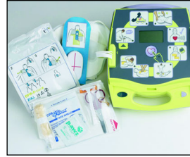
CPR-D•padz come complete with rescue essentials including a barrier mask, a razor, scissors, disposable gloves, and a towelette.

ZOLL's new CPR-D•padz protect the electrode elements with a novel design that sacrifices a non-critical element in the electrode to control the corrosion process and allow an unmatched four-year AED electrode life. ZOLL's CPR-D•padz reduce electrode replacement costs, facilitate AED readiness and maintenance, and decrease the probability of an AED's failure due to electrode expiration.